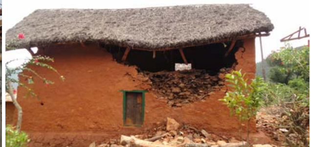
Reduced to rubble...a once thriving village of the Hayu's (pallaquin bearers)