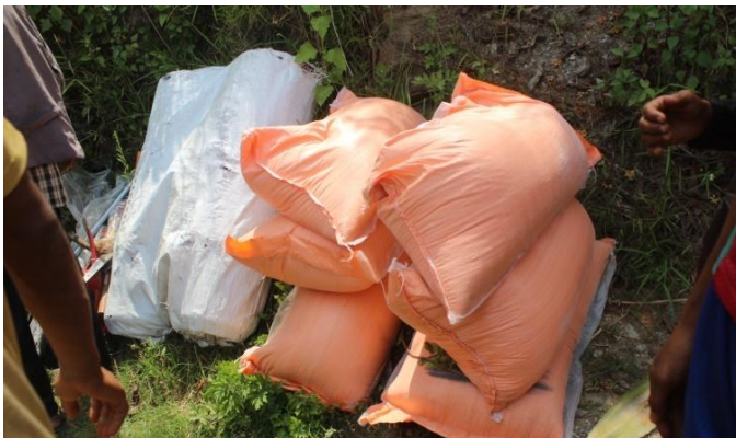
Construction tools set and 10 sack of rice 50 buckets, 50 steel plates and vegetable seeds distributed to villagers of Gairibisaune - 2