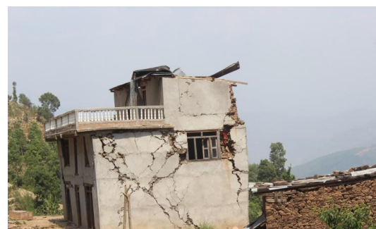
Local House in danger to live