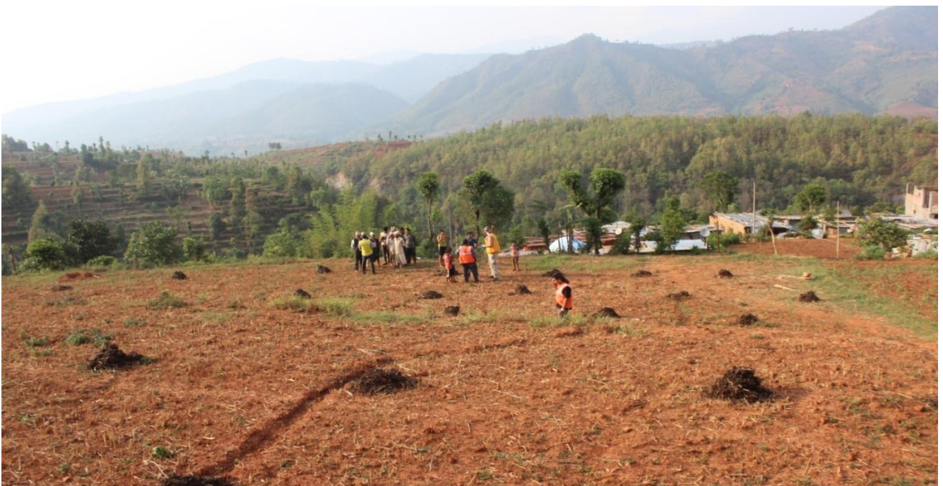
Location for CDRA Integrated Development Project in Mahadevstan VDC – 3 Shelter, water, and economic development project identified

Every place I visited I was met with one reality. The Nepalese peoples fortitude and strength, is rivaled only by their kindness and sense of community. Having felt with Disaster areas where people turned on each other. The people of Nepal are a beacon of hope. Not only will Nepal rebuild, but that they will do as only as the Nepalese can. With community, and the knowledge that they have they will rebuild an even stronger Nepal.