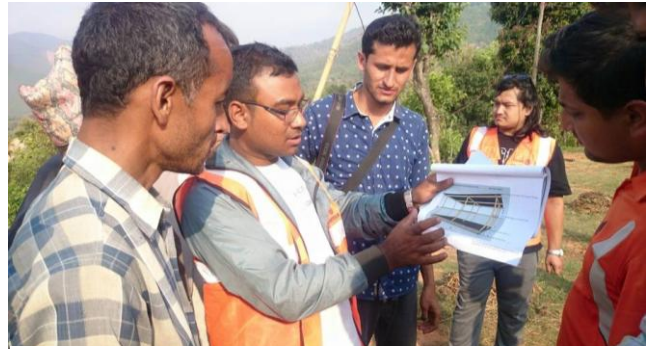
Explaining shelter house to local village leader