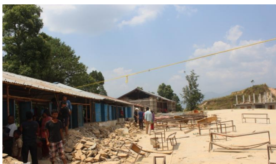
Tapayshwor Higher secondary school collapsed