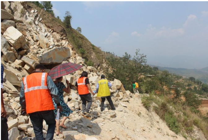
Huge Landslide block the road