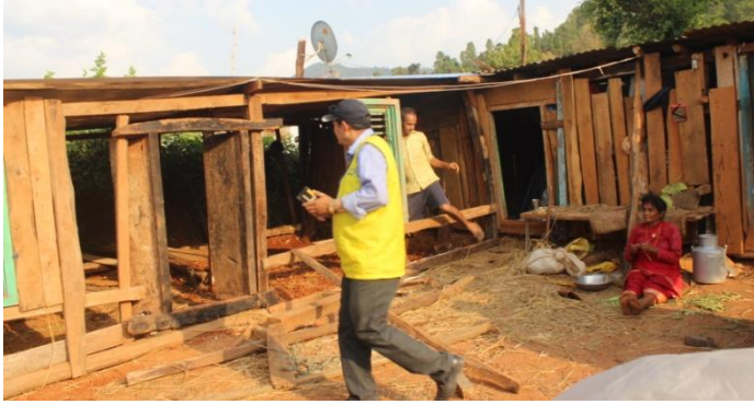
Building shelter with collecting existing collapsed house materials